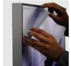
easy to replace