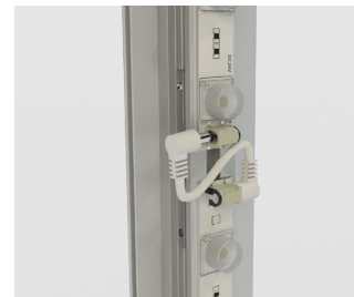
Connection between LED Light Bars