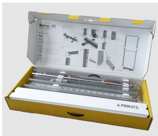
Carton Box LED Banner 80 Open